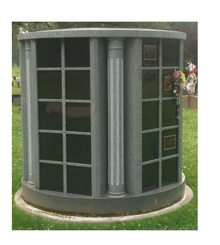
Block 50 Columbarium